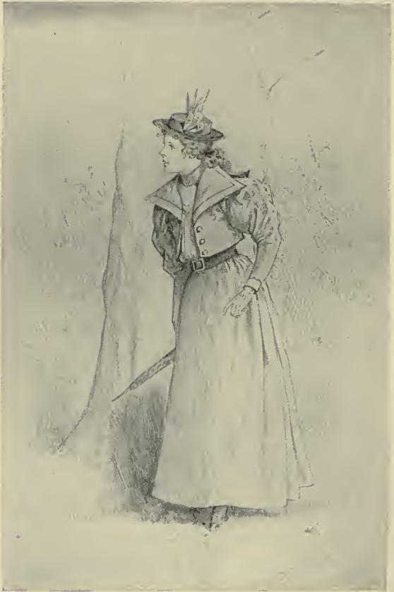
"IT IS SOME OF THE STUDENTS" (Page 71)